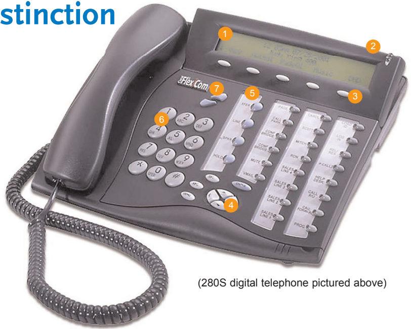
(280S digital telephone pictured above)

Available in your choice of pearl white or charcoal grey, all Coral FlexSets come with four buttons configured system-wide for consistent operation. A system administrator or individual users can define remaining buttons as needed.