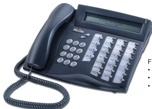
FlexSet 280D • 28 buttons • 2 x 40 LCD • full speakerphone