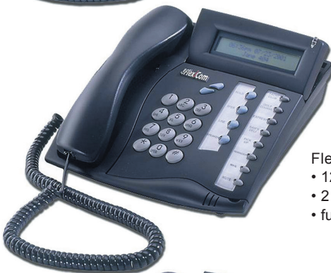
FlexSet 120D • 12 buttons • 2 x 24 LCD • full speakerphone