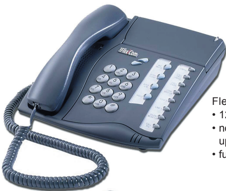
FlexSet 120 • 12 buttons • no display (120 upgrades to 120D) • full speakerphone

ensures you will be ready for the communications demands of tomorrow.