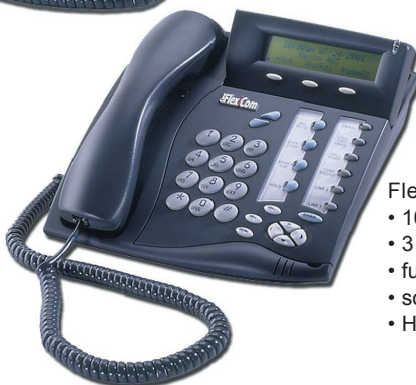
FlexSet 120S • 10 buttons • 3 x 24 LCD • full speakerphone • soft-key operation • HDF support